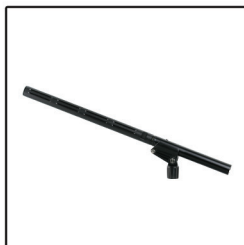
UEM81S on MC81