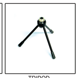
UEM81S on MC81